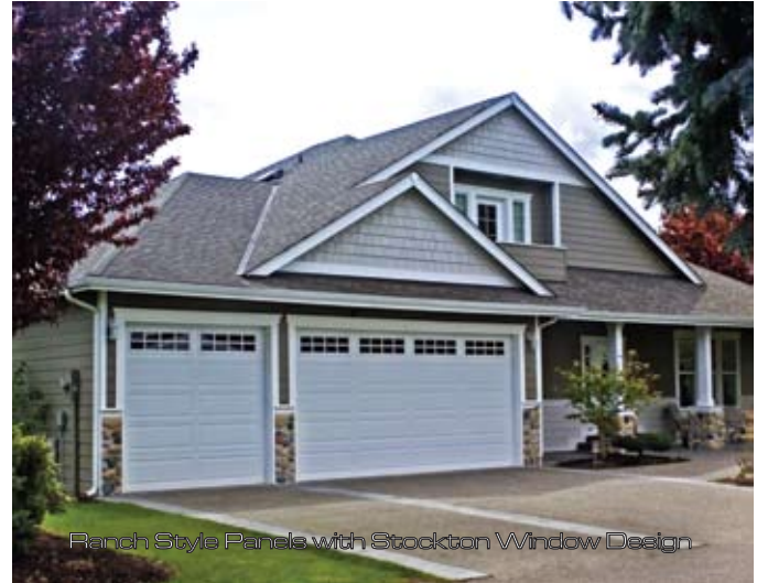
Ranch Style Panels with Stockton Window Design